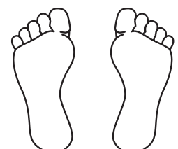
Length of Foot